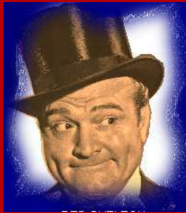
Richard Bernard "Red" Skelton July 18, 1913 - September 17, 1997

As Red would say, "I personally believe we were put here to build and not to destroy. So, if by chance, you are not feeling well and you should remember some silly little thing I have said or done and it brings back a smile to your face or a chuckle to your heart - then my purpose as your clown has been fulfilled."